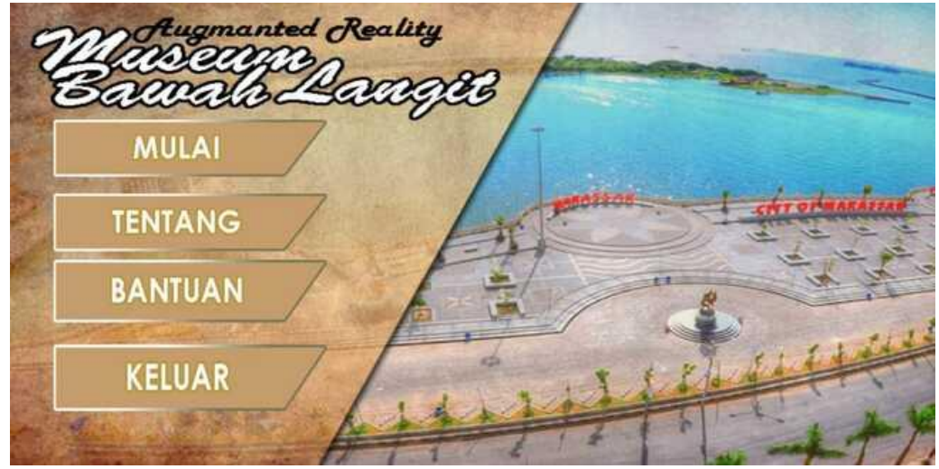
Figure 8. Main Menu Display

When the application is run, the main menu will appear, which consists of the "Mulai" button to enter AR mode, the "Tentang" button to enter the application maker's information, the "Bantuan" button to see how to use the application, and the "Keluar" button to close the application shown in Figure 8 .