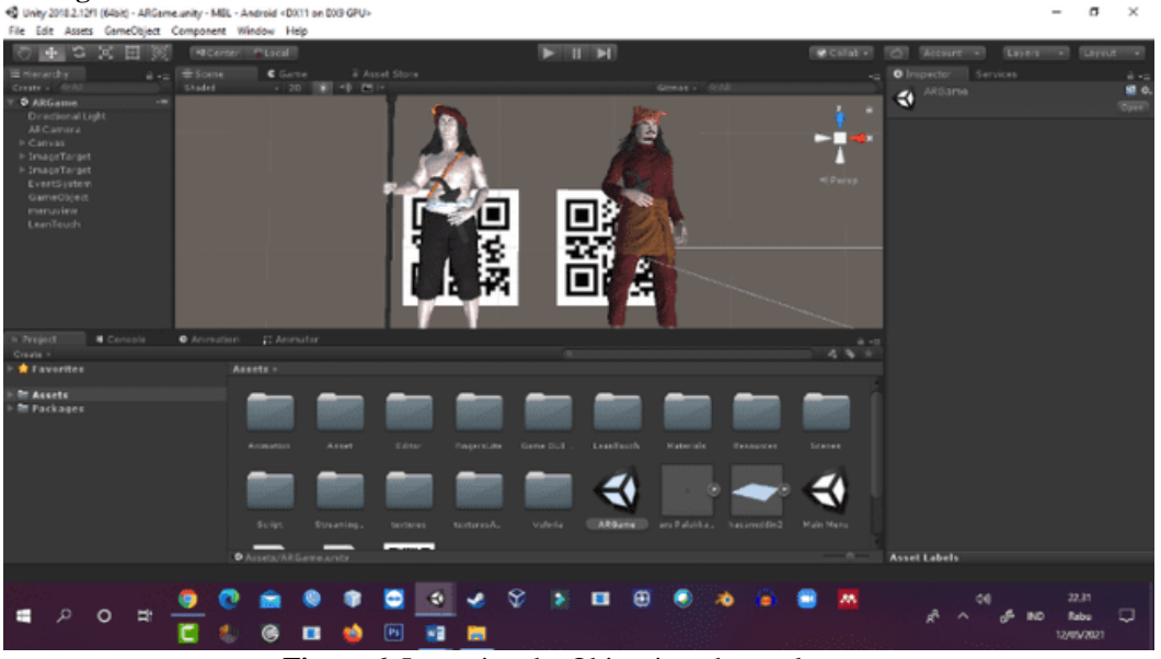
Figure 6. Importing the Object into the marker

After entering the marker, the #D object is inserted into the marker that has been imported via AR camera shown in Figure 6 .