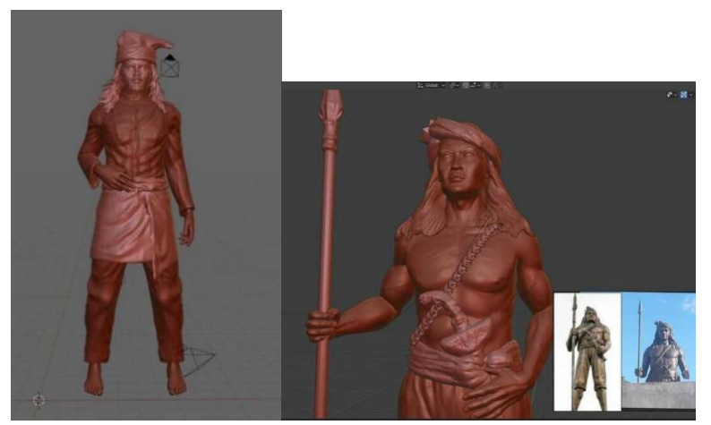
Figure 3. Three-Dimensional Modeling for Augmented Reality

Three-dimensional modeling is carried out before designing the Augmented Reality application. This research uses Blender with FBX format in the process of making three-dimensional models. Figure 3 shows a three-dimensional model of Arung Palakka and Sultan Hasanuddin.