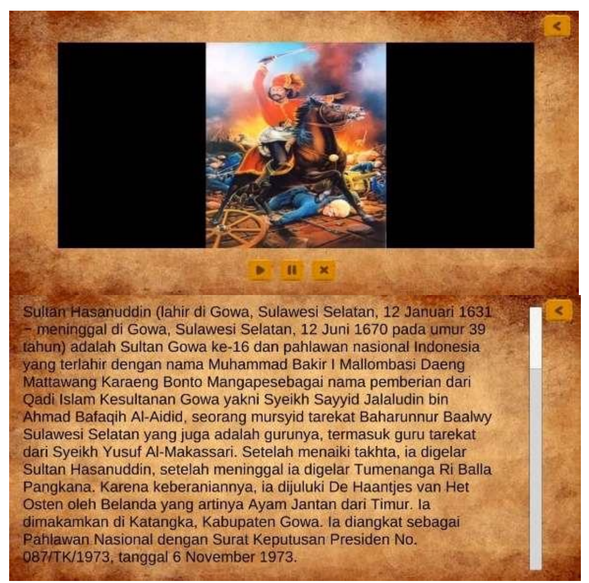
Figure 10. Description Menu

After pressing the play button, a scene will appear that plays video and sound as well as shows an additional description of the tracked hero. The Description menu displays birth history, biographies and some important related information shown in Figure 10 .