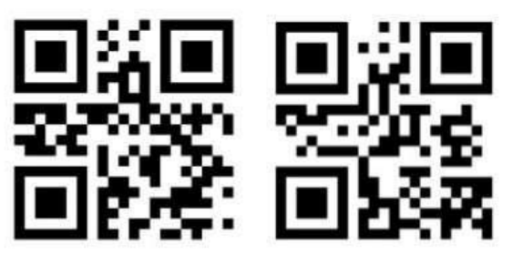
Figure 4. Marker database

The database used in the application was developed using a collection of markers that have been created by previous researchers. To enter the marker database into the Augmented Reality application, account registration is needed in the Vuforia website to enable login and register the marker that have been created. Figure 4 shows the marker database that has been created.