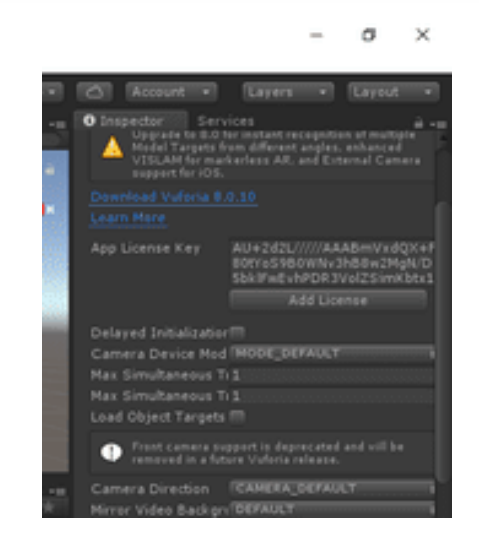
Figure 5. License key

AU+2d2L/////AAABmVxdgX+FSOtYoS980KHv3hB5v2NgN/D5bklFvEvhFDR3VolZ5jm%btx17Den5xhj5a2deDyuO+JddnN+dvQaj IV+EHTftFBELLchANcW7n5Nf5%bDGXjcR1K7nXFs7pD2sF+SLjdtDHKq%nAbUFgoU4dpYWJUa9/9YZNi2nyfi6a5HH0QaFlbtfbvi JyzNS3VZptWrQ7%oUXdCvFhiw6Aewqcf2RtN6ei+9GIaAxdaeO+uXE/IGdCwJ3RDFjx1VGcK5v+ViYnaJKTv7133L9yKkFNQhlq5u jonrmN1R2SudcOfUbqmjcc7As++FiP665pNq191viKYsBiSLFS18/1HVikHPjGkUb9Q+H0EbgfCDo